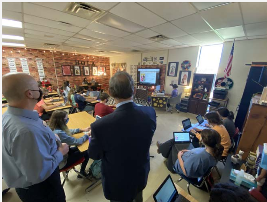
Visiting a Vilonia HS classroom and observing live instruction.