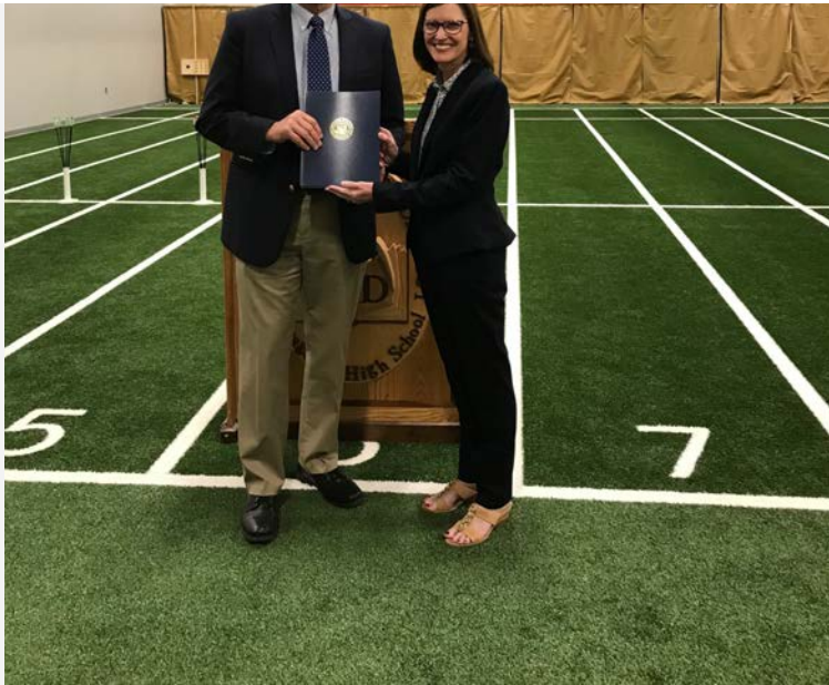
Presenting Paragould High School with a Congressional Record and thanking teachers and staff for all their efforts.