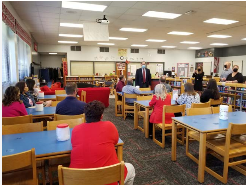
Sharing some encouraging thoughts with and thanking teachers at Vilonia High School.