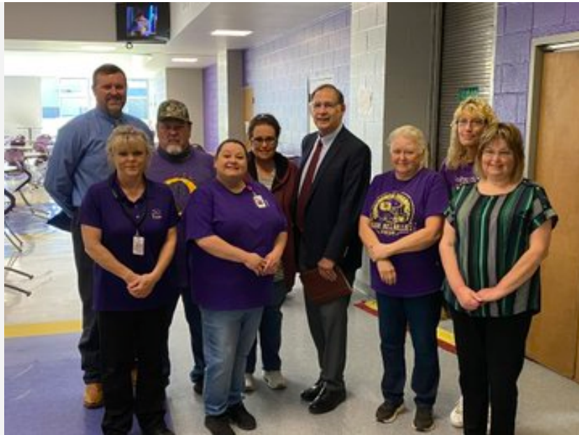
I joined teachers, staff and students at Ozark High School to share my appreciation for these wonderful examples of dedicated educators.