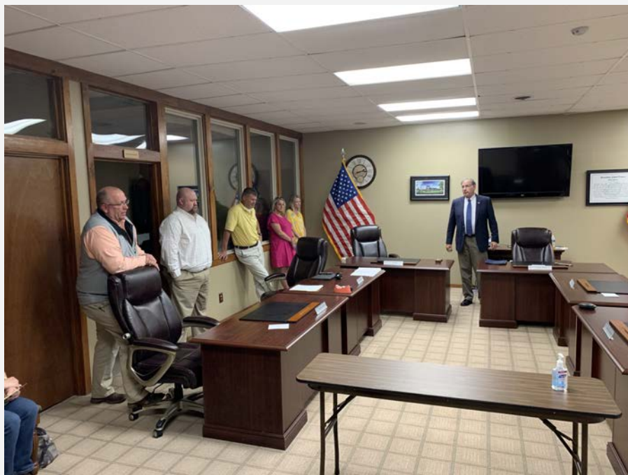
Meeting with the Superintendent of Harrisburg Schools and reiterating my thanks to the entire HPS staff for their hard work.