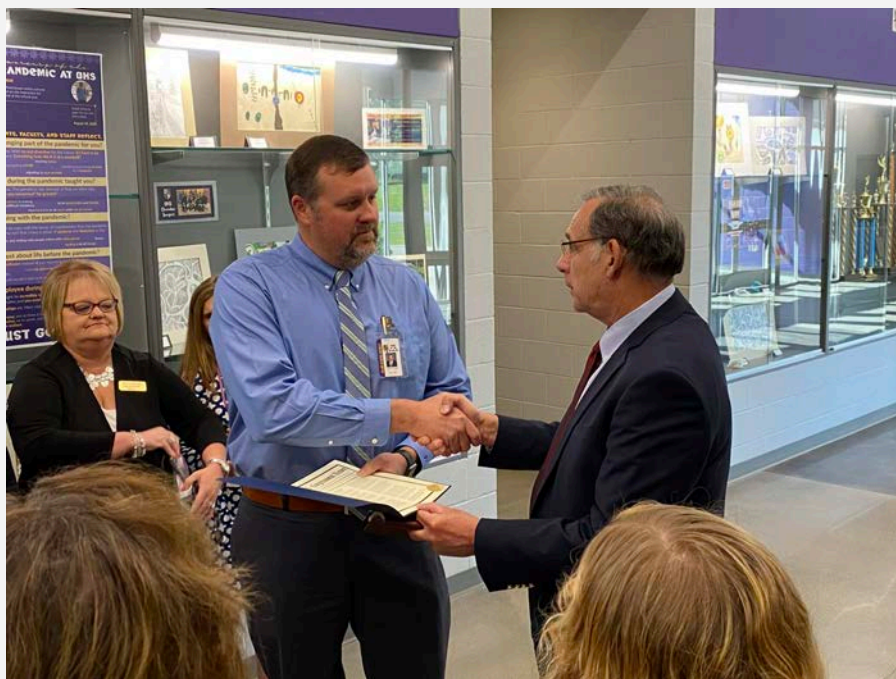
Presenting a copy of the Congressional Record to Ozark HS.